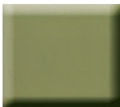
Relentless Olive (REL)