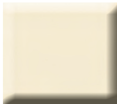
Creamy White (CRE)