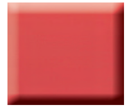
Quiet Coral (QUI)