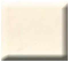
Classical White (CLA)