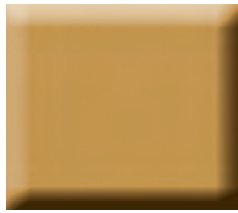
Bosc Pear (BOS)