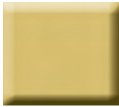
Independent Gold (IND)