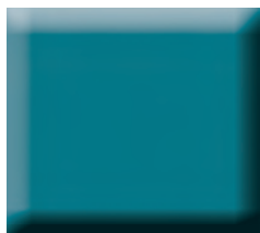
Intense Teal (TEA)