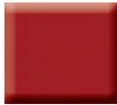
Red Bay (RED)