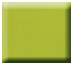
Hep Green (HEP)