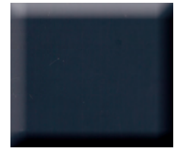
In the Navy (ITN)